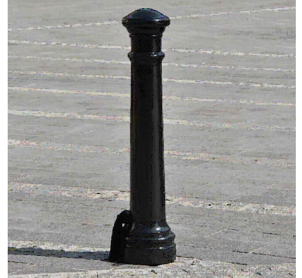
Indicative low-level bollard intent